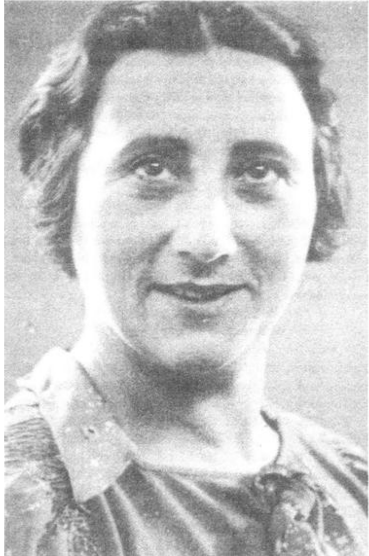
Edith Frank, May 1935.

Mother doesn't like me going up there. She says that I should leave Peter alone. She always looks at me oddly when I go to Peter's room. When I come down again, she asks me where I've been.