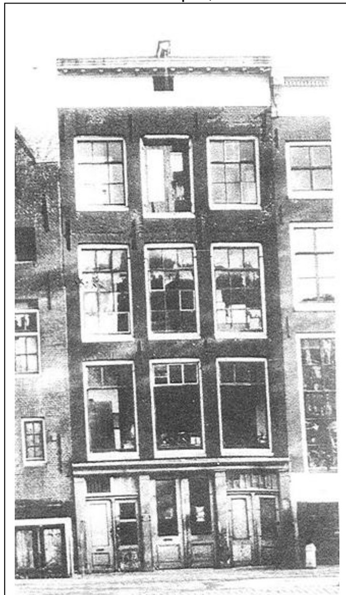
263 Prinsengracht, Amsterdam. Front view.

But now there are no vegetables at all. We have potatoes, and brown beans. We make soup — we still have some packets and stores to make dishes which are a little bit more interesting. But it's beam with everything, even in the bread.