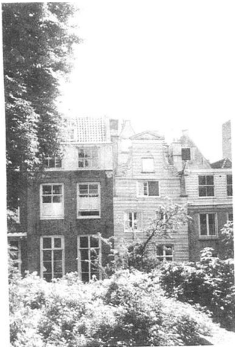
263 Prinsengracht, Amsterdam. Seen from the rear.

The mood has changed, and everything outside is going